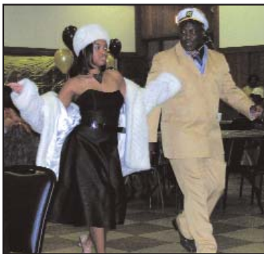
High Fashion from the Milwaukee FAST Program's Fashion Show

The Milwaukee FAST office in Wisconsin held a Vintage Fashion Show on October 2 nd to raise funds for FAST-WORKS. The event showcased fashions from the 1800's until present day. The show was a way to recapture the essence of value in fashion and to educate those who do not know the revolution of freedom in fashion. Young people learned about the history of fashion and that clothes can be a representation of the wearer's values. We applaud your creativity, Milwaukee FAST!