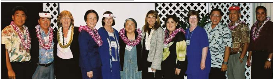
VIPs at the Hawaii FAST Reception, September 30, 2004.