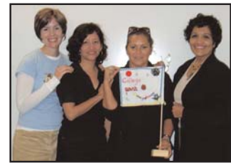
The first Alliance teams to be trained by FAST National. Costa Mesa, California, November 12-13, 2004.