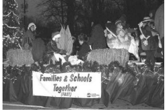
The parade takes place after dark and the floats are decorated with lights

Thanks for sharing the photos Liz, it sure looks fun!