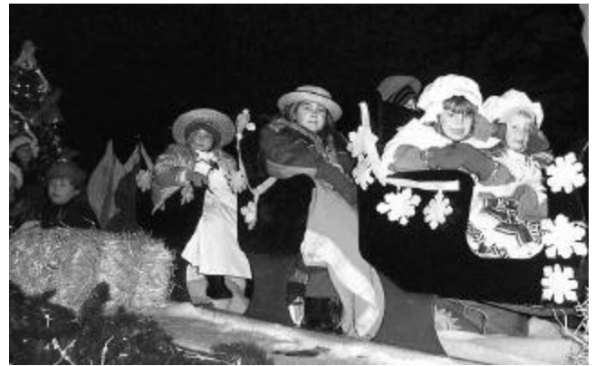
The children are seated on benches that look like a sleigh and are decorated with snowflakes.