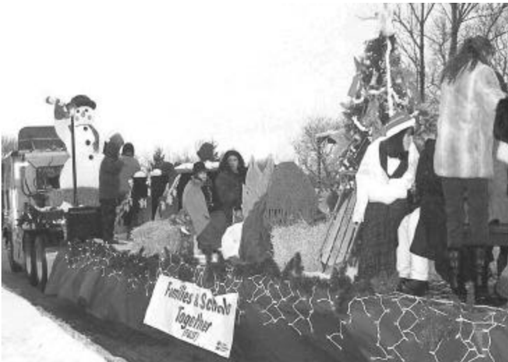
The float, built on a flat bed semi trailer, had a large snowman, sleigh, bales of hay, a Christmas tree, school house and plenty of seating!