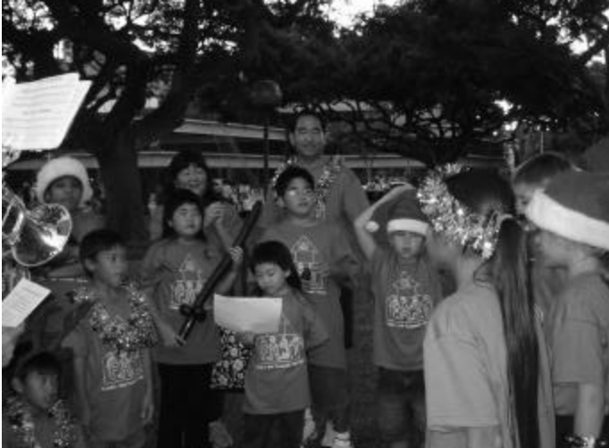
The group, wearing their colorful T-shirts, practice hitting their notes before the event. Congratulations on taking first prize!

-Mililani Middle FASTWORKS took part in one of Hawaii's popular holiday events, The Honolulu Ad-