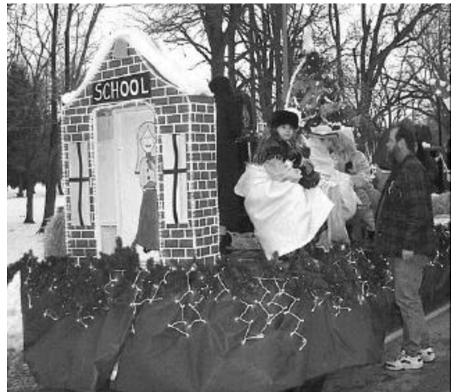
A close up of the back end of the float and some of the FAST/WORKS participants. Getting ready to roll.